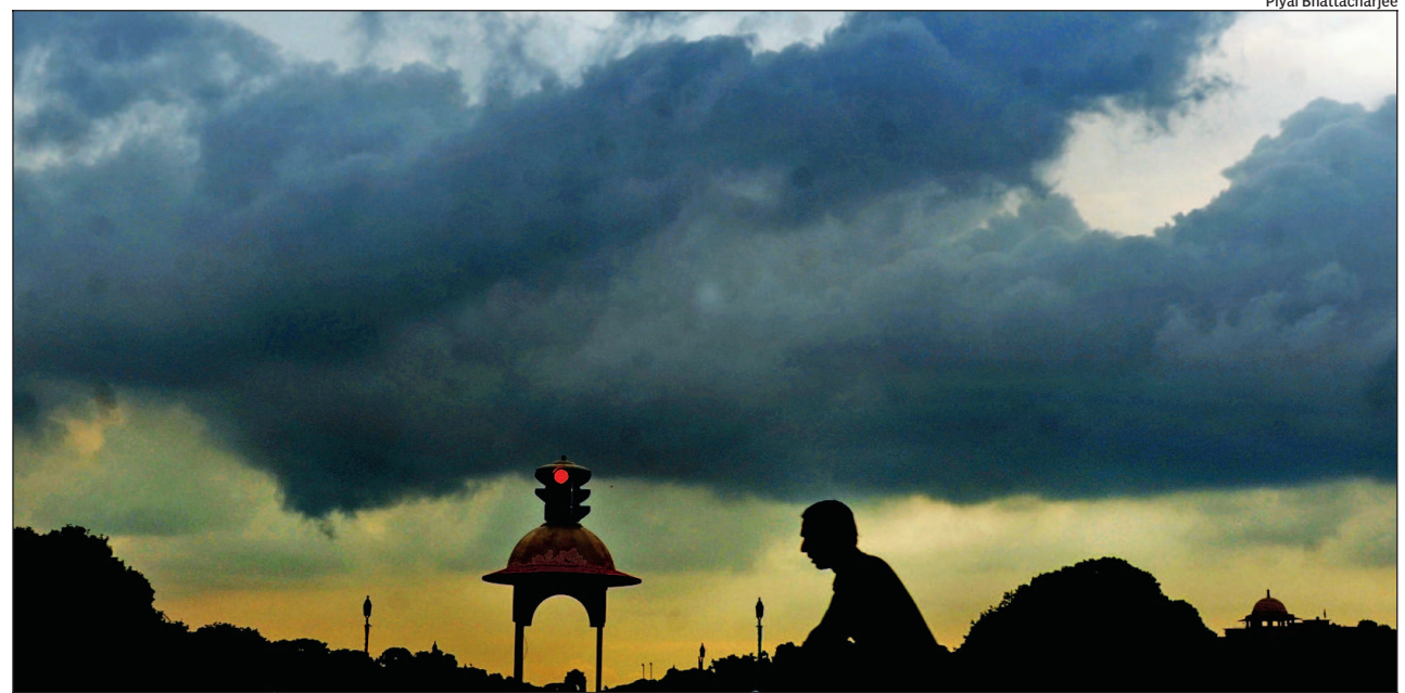
WAITING TO POUR: While southwest and west Delhi saw heavy showers on Wednesday, central Delhi areas were left asking for more

By Wednesday evening, while the monsoon system had progressed, parts of Rajasthan and Gujarat were still left to be covered. The northern limit of the system had touched Porbandar, Ahmedabad, Udaipur, Ajmer, Pilani and Ganganagar. "Widespread rain and thunder-showers are expected over Himachal Pradesh, Uttarakhand, UP, Bihar, Madhya Pradesh, West Bengal and Sikkim and Northeast states. It will decline over Himachal Pradesh, Uttarakhand and MP after 48 hours,